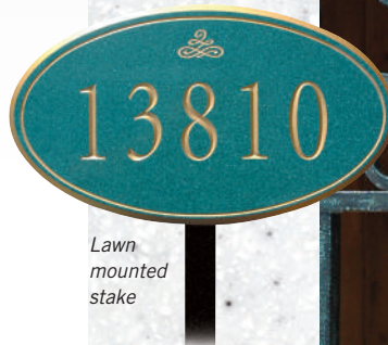
Lawn mounted stake