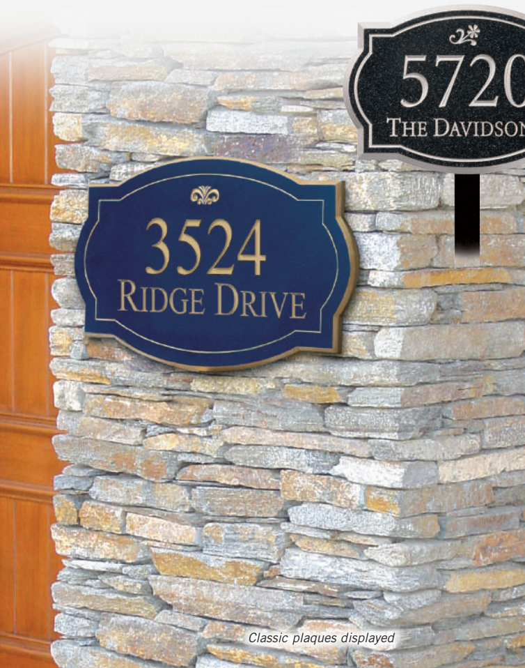
Classic plaques displayed

Made of 1/2" thick solid acrylic, Salsbury 1400 series signature series plaques feature the natural beauty of granite with the durability of "solid surface" counter tops and are ideal for schools, clubs, homes, businesses and many other applications. Signature series plaques are weather resistant and available as surface mounted or lawn mounted and in seven (7) attractive styles. The elegant signature series plaques have engraved gold or silver painted characters / trim on a background that can be specified black, cobalt blue, jade green, maroon or white. Each plaque is available with five (5) specified emblems or no emblem. Surface mounted signature series plaques include two (2) key holes for easy mounting. Lawn mounted plaques include one 2" W x 19-3/4" H aluminum stake that is powder coated black. Small oval plaques are available in a hanging style (#1435) and include mounting hardware to attach to mailbox posts and spreaders. Oval-petite plaques (#1439) are ideal for doors and many other applications, while column plaques (#1470) are ideal for mailbox posts and many other applications. For larger versions of these plaques, see Large Commercial Signage on pages 98-99. For customized versions of these plaques, see Custom Plaques on pages 100-101.