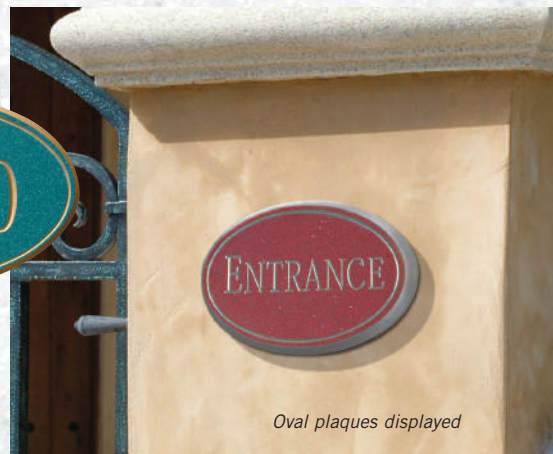
Oval plaques displayed