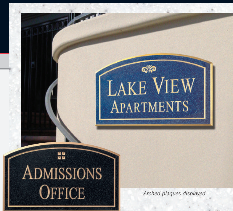
Arched plaques displayed