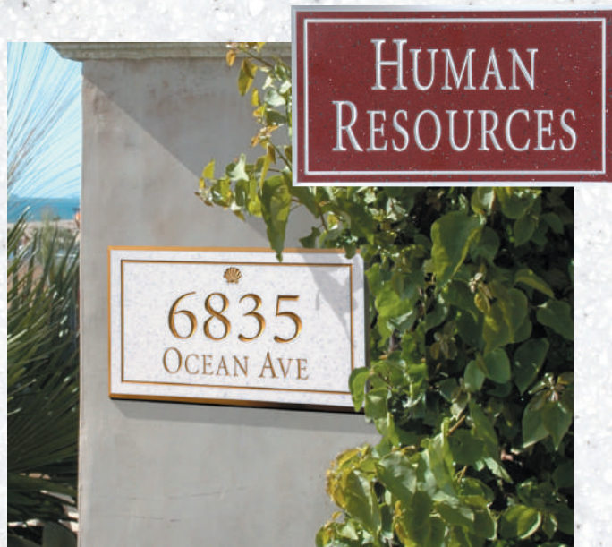
Rectangular plaques displayed