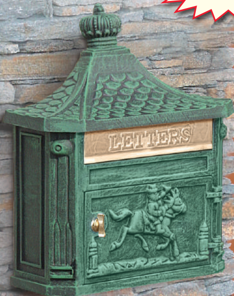
#4460 with optional thumb latch (#4488) displayed