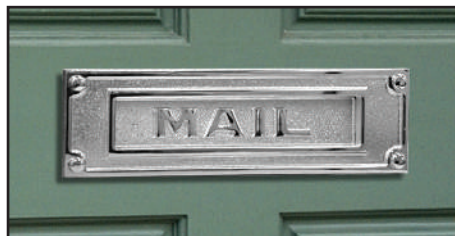
Front view of #4075 in chrome finish displayed