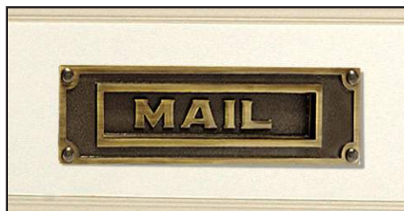
Front view of #4075 in antique finish displayed