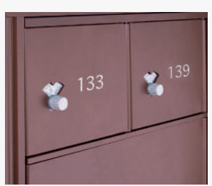
Custom horizontal mailbox with com- • Self-adhesive numbers - sheets of (100) bination locks (#3686) and custom regular engraved doors (#3668) in bronze finish displayed.

(for installations not serviced by the U.S.P.S.)