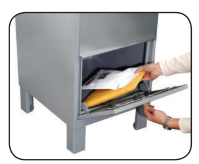
Secure collection of items