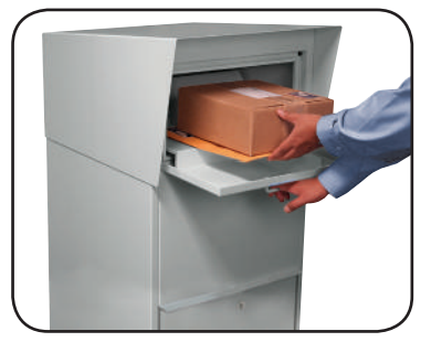
Convenient depositing of items