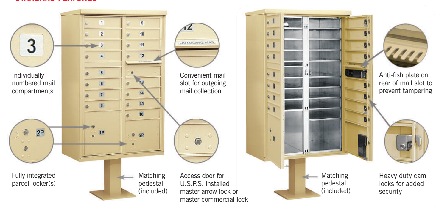
Front views of 3316 in sandstone finish displayed